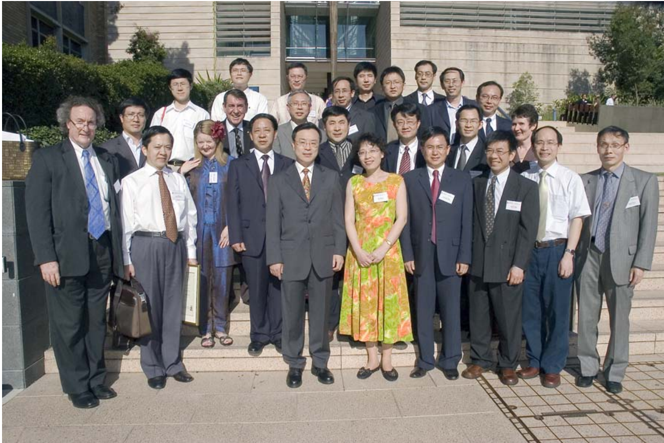
Visiting Research Fellows from China at the 2008 International Research Workshop

THE UNIVERSITY OF NEW SOUTH WALES SYDNEY • CANBERRA • AUSTRALIA